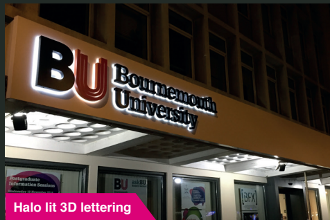
Halo lit 3D lettering

During the beginning months of 2018, we were tasked with helping design and manufacture internal and external way finders to be fitted around the University's Fusion building. The reason for the way finders were to help maximise the efficiency of the campus and point students and staff members in the correct direction. Although the University mainly utilises their own internal fitters to install the graphics, our challenge was to ensure that the designs were correctly sized for all internal and external placements and ensure that the way finders were packaged and delivered on time and undamaged. We have been able to continually produce and deliver outstanding way finders to the client and they have been thoroughly impressed with the level and quality of the work we produce and for this reason continue to support our business.