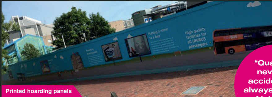
Printed hoarding panels

“Quality is never an accident, it is always a result of intelligent effort”