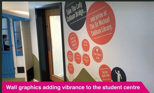
Wall graphics adding vibrance to the student centre

In 2015, the university opened up their student centre which is one of the main buildings at the university, comprising of six storeys and containing a range of social and collaborative learning spaces. With this we were tasked with manufacturing a large scale print of the University's logo to be installed at the top of the large building to help advertise the student centre and the University. The challenge with this project was the size of the print and manoeuvring the large graphic through the warehouse and delivering it to the university.